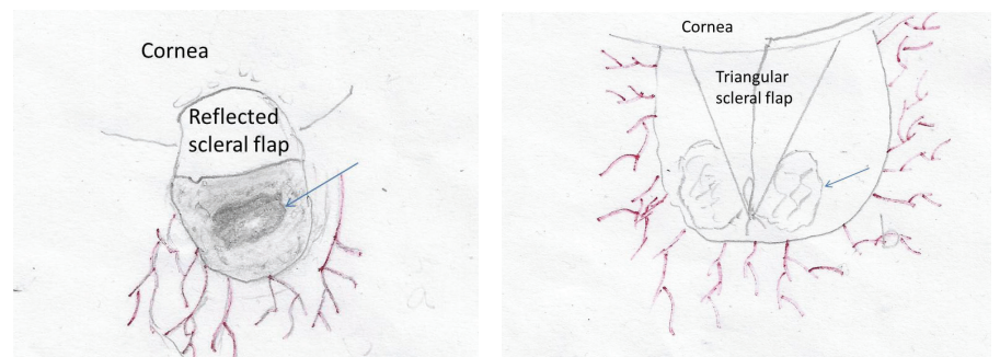
Fig. 1. (Left) Originally described technique of subscleral Ologen implantation requiring fashioning of gutter for Ologen placement (arrow). (Right) Technique used in the present study. A piece of Ologen is simply tucked at the apex of the scleral flap (arrow) and the releasable suture tied tightly. The piece juts out on either side, resembling a "wick".

Data with regards to previous intraocular surgery, baseline intraocular pressure (IOP), antiglaucoma medications, anterior segment fundus findings, visual fields, complications, postoperative IOP, antiglaucoma medications and bleb morphology were collected.