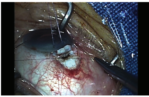
Fig. 4. Direct cyclopexy, OS.

One-week after cataract surgery and cyclopexy, OS, VA improved to 20/20, the anterior chamber was formed with open angles and the IOP was 18 mmHg.