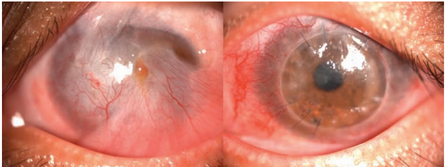
Fig. 2. Pre- and postoperative images of Case 2, where the patient underwent COMET followed by PK. The central cornea button remained clear with no evidence of rejection.