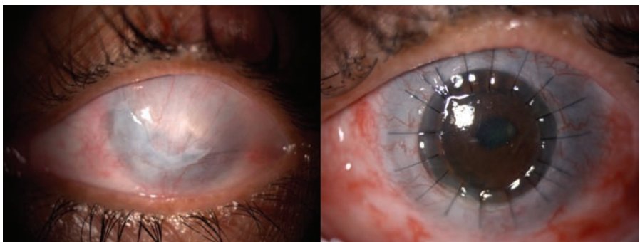
Fig. 4. Pre- and postoperative images of Case 4, where the patient underwent COMET followed by PK. There was an improvement in corneal clarity and ocular surface.

in his right eye was counting fingers. Ocular examination revealed right inferior symblepharon with total cornea epithelial defect and severe limbal ischaemia. One year post injury, he underwent right eye COMET, followed by PK with cataract extraction and intraocular lens implantation seven months post COMET (Fig. 3). Visual acuity at three-months postoperatively was hand movement with failed corneal epithelial healing. At five months post PK, he developed acute graft rejection which was treated with intensive steroids. However, his vision did not improve much and remained at counting fingers at three feet. During the last review, there was presence of heavy vascularisation and a small persistent epithelial defect of the cornea. His follow-up duration was 4 years.