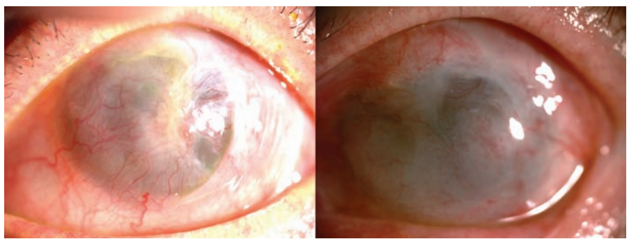
Fig. 6. Pre- and postoperative images of Case 6. The cornea remained hazy with presence of vascularisation despite undergoing COMET twice.