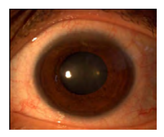
Fig. 3. Slit photograph of involved eye at last visit, with no sign of recurrence.

After excision, the patient was treated with Fluorouracil drop 50 mg/dl QID for two pulses of two weeks duration with one week pause between them. There was no sign of recurrence till the time of the final follow-up examination (45 days after the surgery). At the final examination, the visual acuity on his left eye was 9/10 and dry eye symptoms were disappeared completely (Fig. 3).