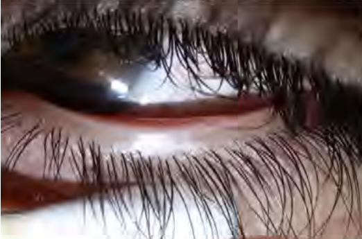
Fig. 2: Absence of meibomian orifices in the lower eyelid of the Son