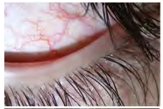
Fig.1: Absence of meibomianglands and orifices in the lowereyelid of the Son