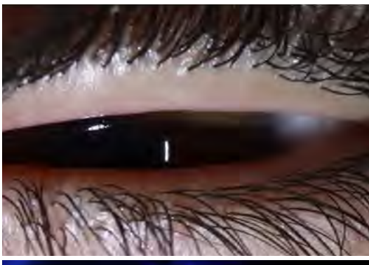
Fig.3: Absence of meibomian glands and orifices in the upper eyelid of the Father